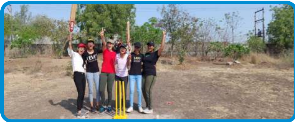
IT Girls Cricket team crowned as a Champion.