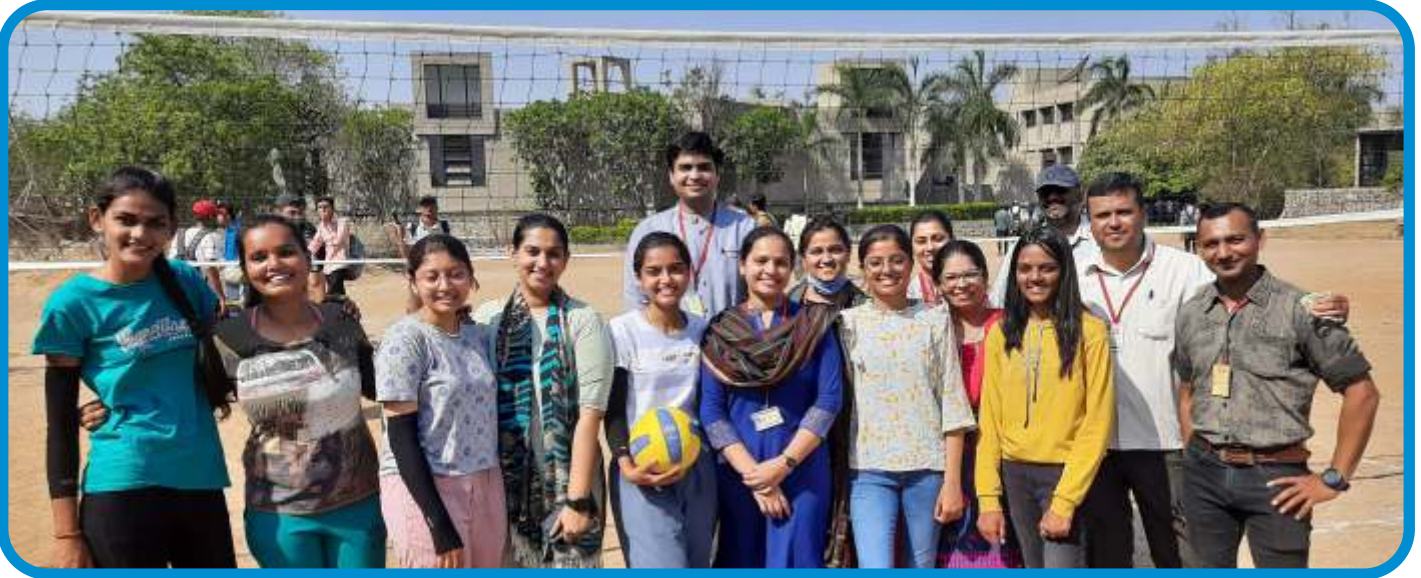
IT Girls Volley Ball team crowned as a Champion.