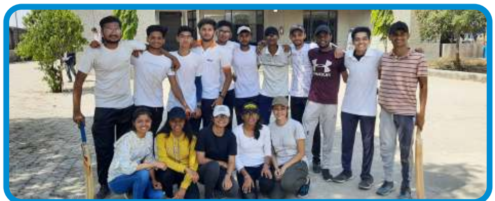
IT Boys Cricket team crowned as a Champion.